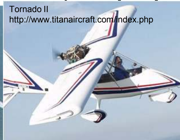
Tornado II http://www.titanaircraft.com/index.php