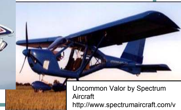
Uncommon Valor by Spectrum Aircraft http://www.spectrumaircraft.com/valor.shtml