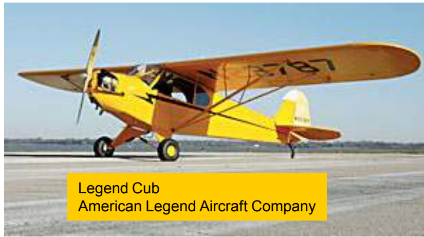
Legend Cub American Legend Aircraft Company