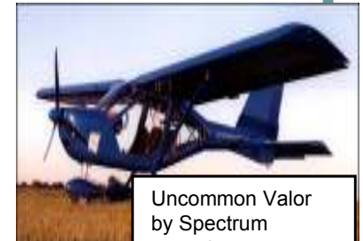
Uncommon Valor by Spectrum Aircraft http://www.spectrumaircraft.com/valor.shtml