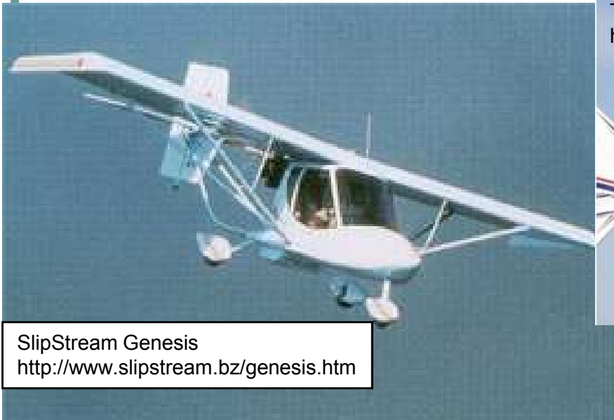
SlipStream Genesis http://www.slipstream.bz/genesis.htm