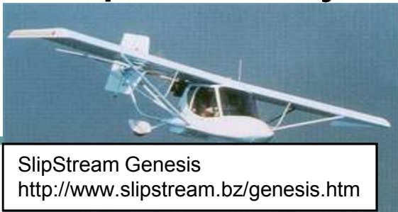
SlipStream Genesis http://www.slipstream.bz/genesis.htm