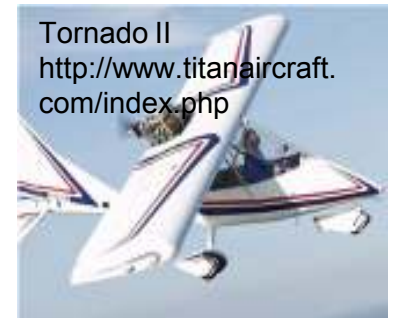
Tornado II http://www.titanaircraft.com/index.php