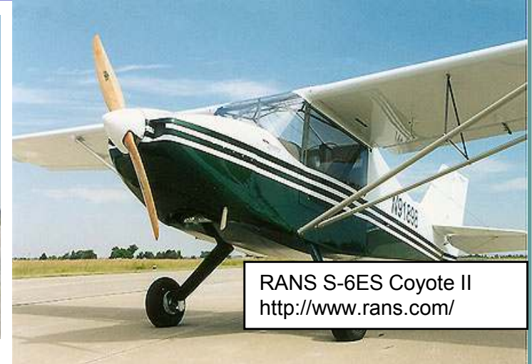
RANS S-6ES Coyote II http://www.rans.com/